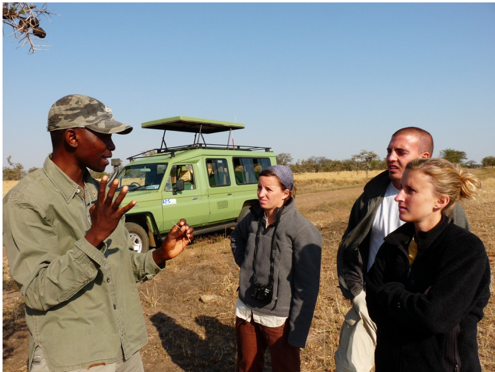
Milinga University in the raw!

WinWin Vacations, Africa Safari Specialist, PO BOX 30903, Seattle, WA 98113-0903 USA Phone 206-297-7179, Toll Free 877-297-7179; Fax 425-696-0247 Wash. Seller of Travel #601433464