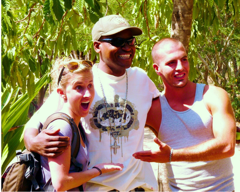
We're in love with Robert!

Say goodbye to Mbalageti and drive to Migration Camp; it's a 4-hour drive plus all the interesting stops along the way.