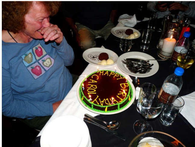
I LOVE birthday parties!!!

The camp offers game drives, ranger-led bush walks, ornithology and sightings of various wildlife. Being located on one of the main annual migration corridors for over 1 million wildebeest, half a million zebras and gazelles, and their accompanying cast of predators, the camp enjoys a ringside seat for one of the greatest wildlife spectacles on earth.