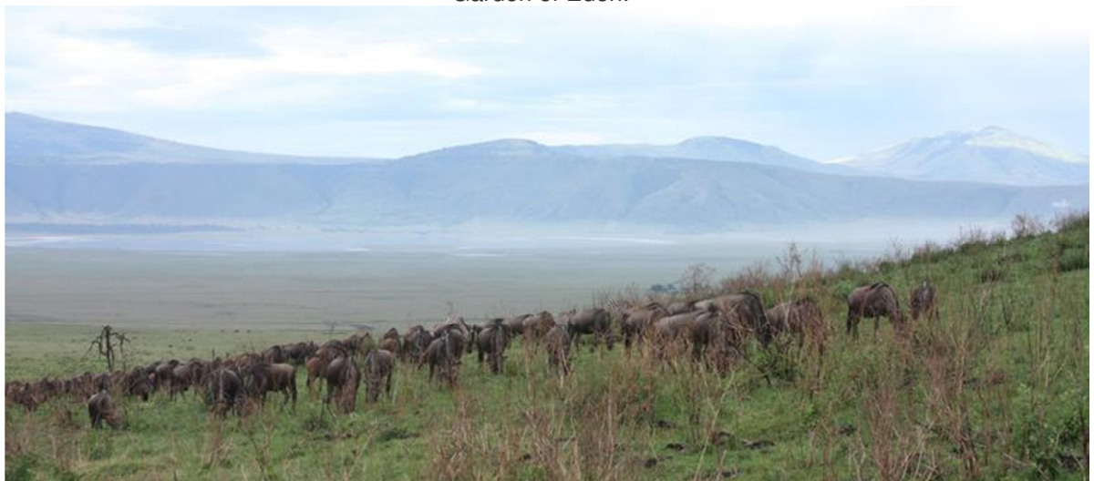
Garden of Eden.

In the Great Rift Valley, that great schism in the earth's crust, lies the wonderful Ngorongoro Crater, one of the wonders of the natural world. It is an extinct volcano that collapsed in on itself around 25 million years ago thus forming a vast superbowl where the largest permanent concentration of African game is on display. Wildly beautiful as it is, it is not surprising that the ongoro Crater has been called: