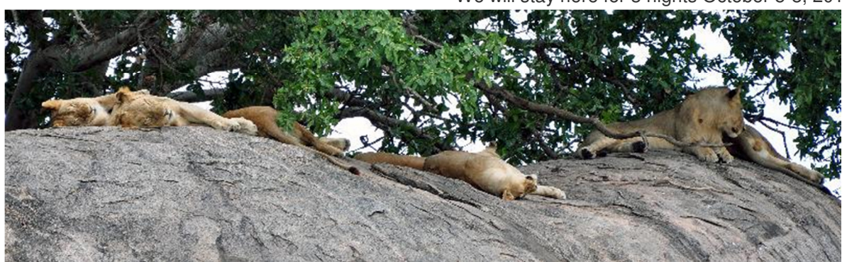
Lions on a rock in Moru Kopjes

We will stay here for 3 nights October 5-8, 2011