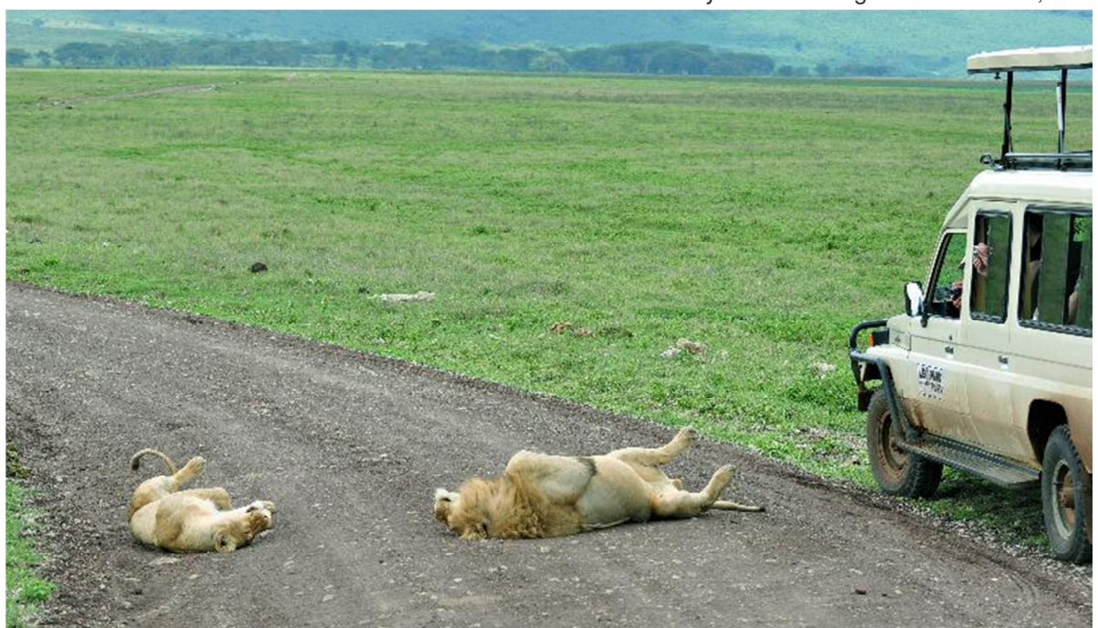
Ngorongoro Crater road block

We will stay here for 2 night October 8-10, 2011