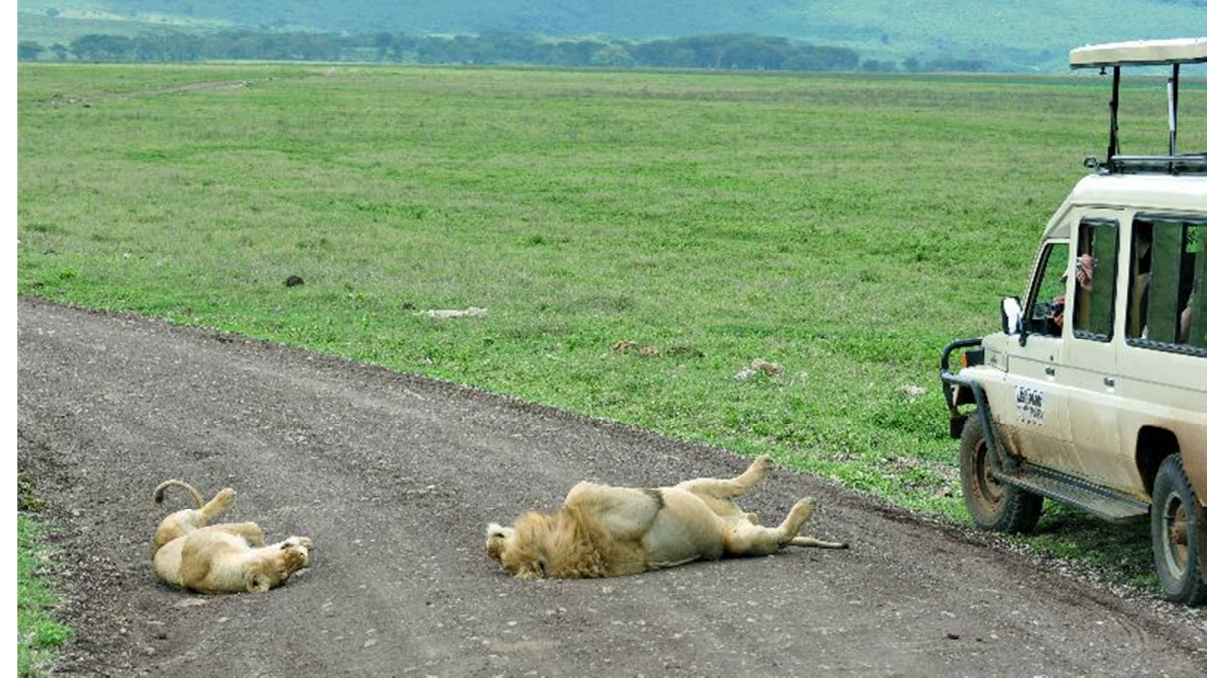
Ngorongoro Crater road block

We will stay here for 2 night October 8-10, 2011