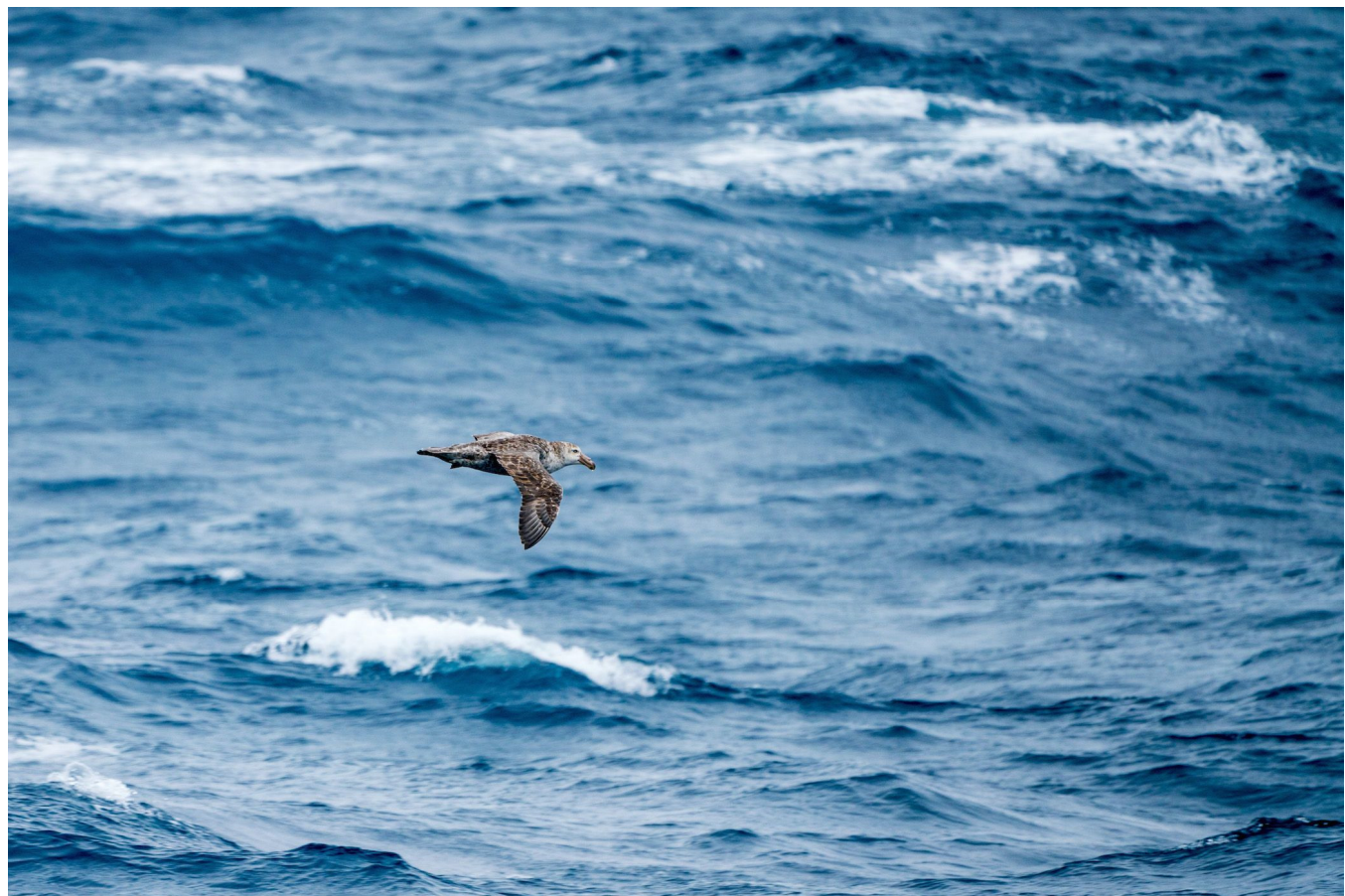
A southern giant petrel is silhouetted against the gentle swells of the Scotia Sea.