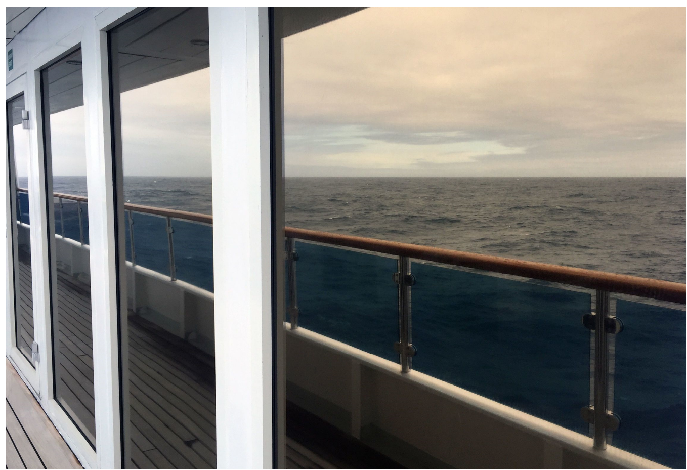
The calm swells of the Scotia Sea reflected in the windows of the ship are a stark contrast to the storm that just passed through the region the day before.